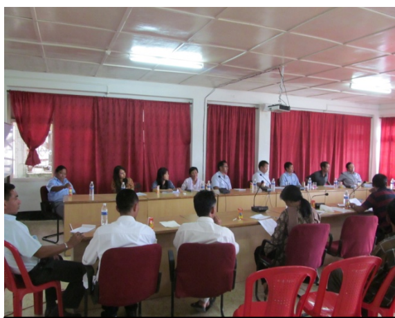
Reviewed meeting of officers on post Interactive Workshop held at DES, Conference hall