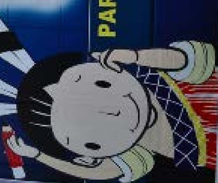
(to be pasted on the overleaf of coverage)