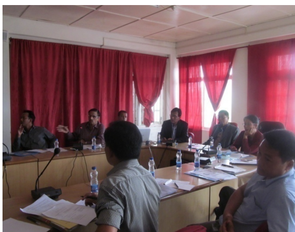
Ministry Officials imparting On-line Training on Births & Deaths to DES and District officials

The Directorate of Economics & Statistics as nodal agency for statistical activities, it is essential for statistical personnel to acquire and up date high proficiency in statistical techniques and methodologies from time to time. Keeping this in view, the Department has deputed a good number of officers and staff to various in-service trainings conducted by Ministry of Statistics & Programme Implementation (MoSPI) National Academy of Statistical Administration (NASA), Government of India etc, such as; Basic Statistics during 27-31 August 2012 at National Academy of Statistical Administration(NASA), Greater Noida, UP. Training on `National Accounts' during 17-21 September 2012, at National Academy of Statistical Administration (NASA), Greater Noida, UP, training on `Gender Statistics' during 24-28 September 2012 at NASA, Greater Noida, UP.