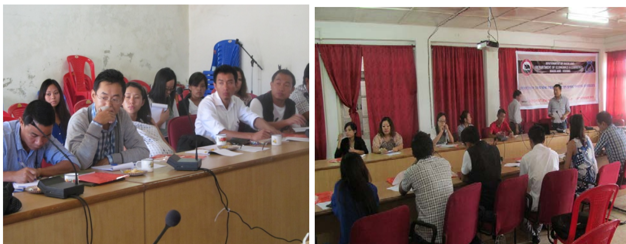
Officers and Staff during the Induction Training held at DES Conference Hall